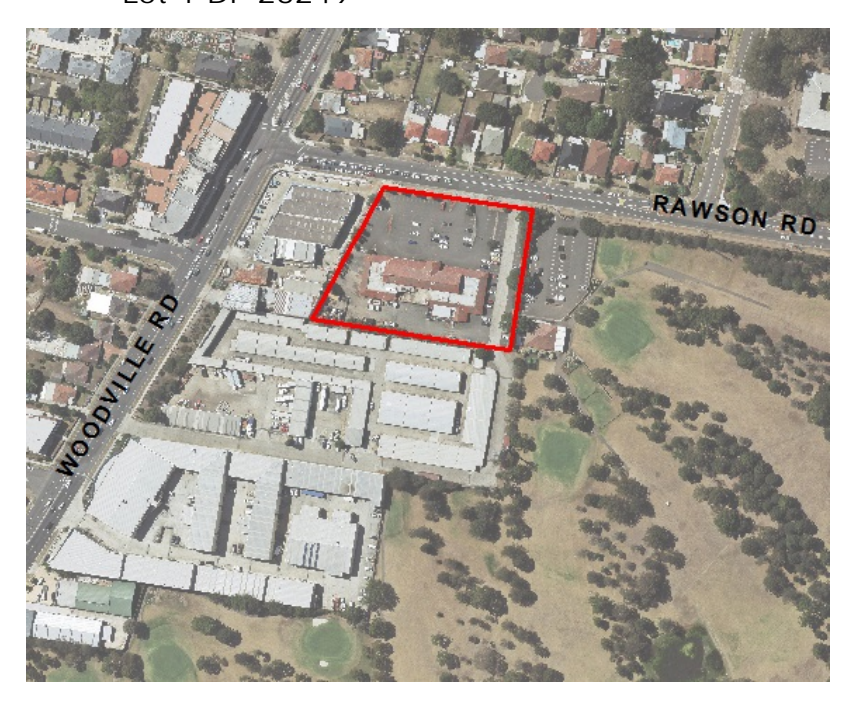
Figure 1 - Site

The site fronts onto Rawson Rd, and is located wholly within the Guildford (Woodville Rd) Industrial Precinct. The current site contains a two storey Hotel (Golf View Hotel) surrounded by a large asphalt car park. A Right of Carriage Way runs along the eastern edge of the site providing access for the storage facilities immediately to the south. The Woodville Public Golf Course is immediately adjacent to the site to the east.